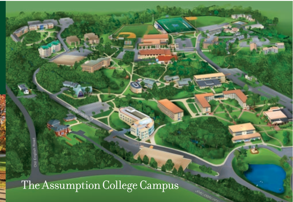
The Assumption College Campus

Assumption College is located in Worcester, MA, one hour from Boston, and Providence, RI, and three hours from New York City.